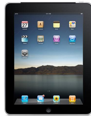
Fig. 3. Example of an image with acceptable resolution